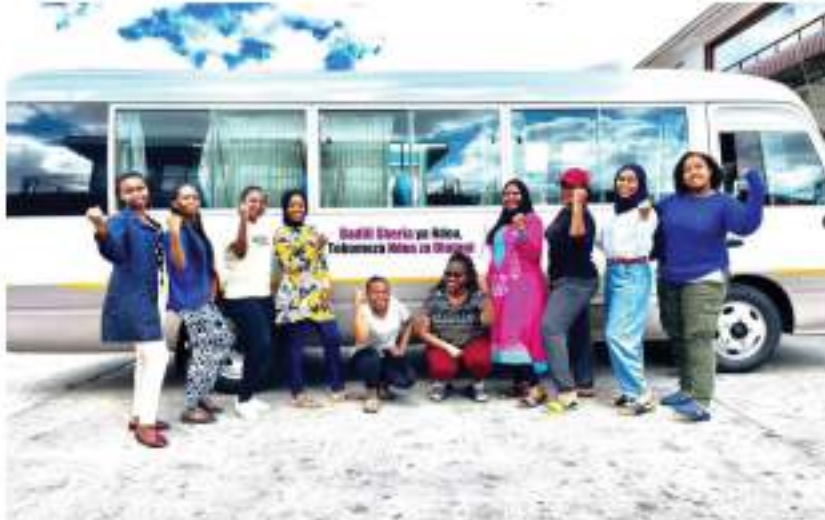
Youth women leaders ready to travel to the regions of Shinyanga, Tabora and Dodoma to meet various adolescent girls who wish to raise their voices.

The need which has led to a two years project (Enhancing Women and Girls' Rights