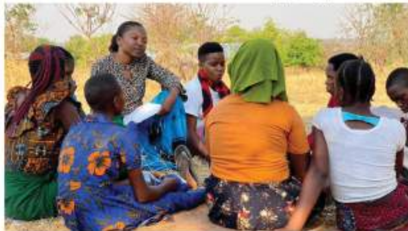
Not all the time male parents are the cause of child marriages, in some cases mothers secretly assent to their daughters' marriage. "I am a 16-year-old girl who was married off September 2021, in absence of my father, my mother received 12 cows as my dowry," a narrator is one of the survivors of early marriages.

"The caravan has given me an opportunity to see the real picture of girls. I learned that the issue of child marriage is not the issue of one person, it is supposed to be the national agenda, and it is true that girls are married at a young age," she said.